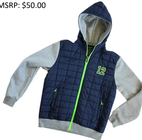
Dutch Harbor Gear 206-244-2600